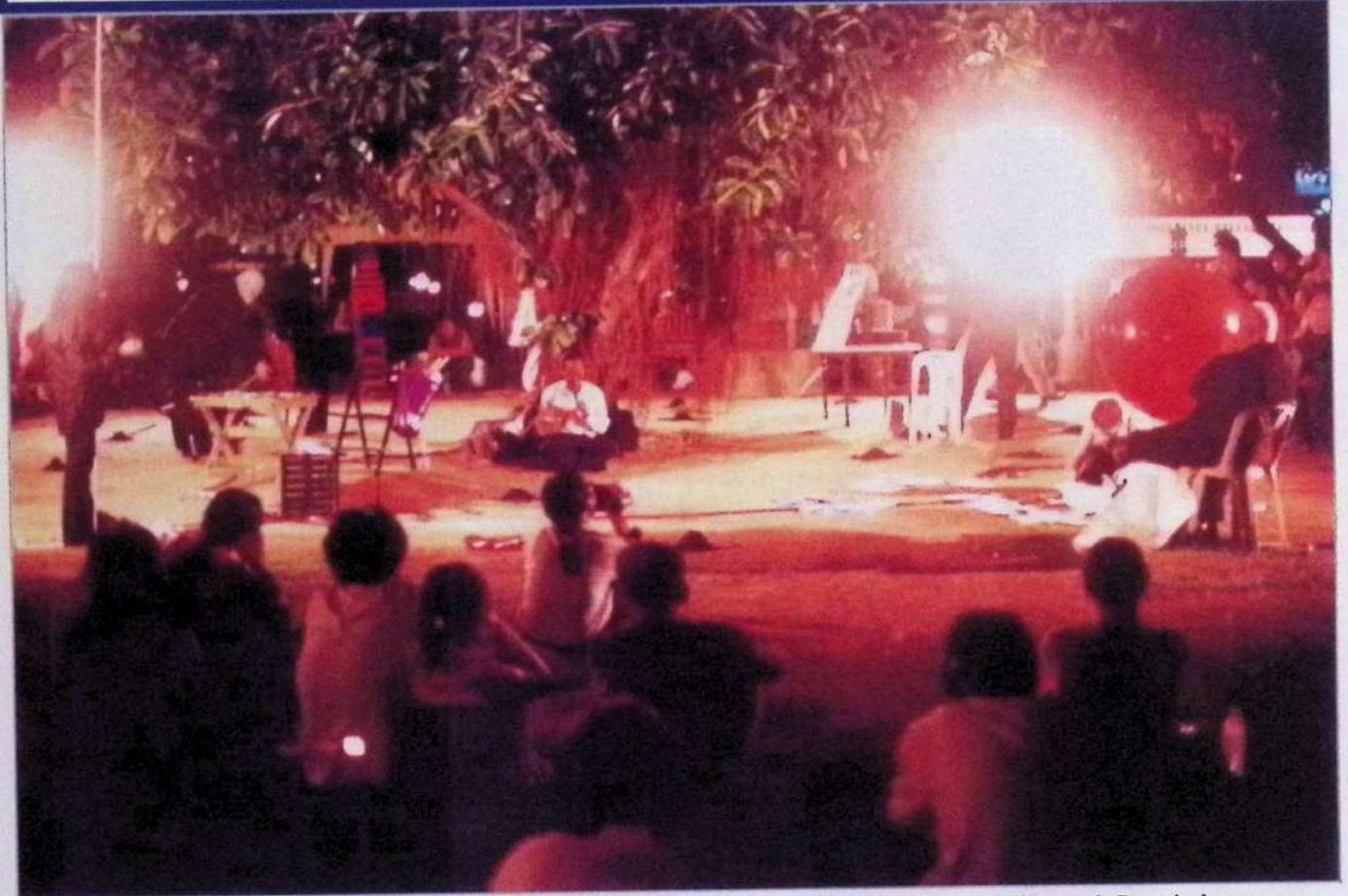
Black Market International at Asiatopia 4/2002, Santichaiprakarn Park, Pra Athit Road, Bangkok

Asiatopia is the longest-running Southeast Asian festival of performance art. Over 400 international artists have performed since 1998. Supported by Bangkok Metropolitan Administration from 1998-2002, and the Bangkok Art and Culture Centre since 2010, since 2011, Asiatopia has expanded into Chiangmai and Chiangrai, Korat, and Nan, providing workshops with young students and artists.