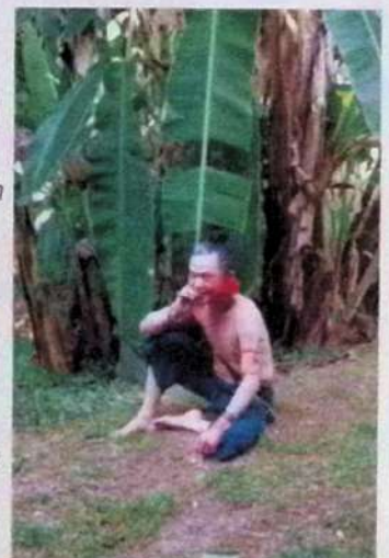
Top: orientation at Hug Nan Foundation